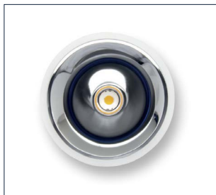
Reflector - Darklight