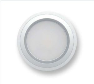
Reflector - Matt